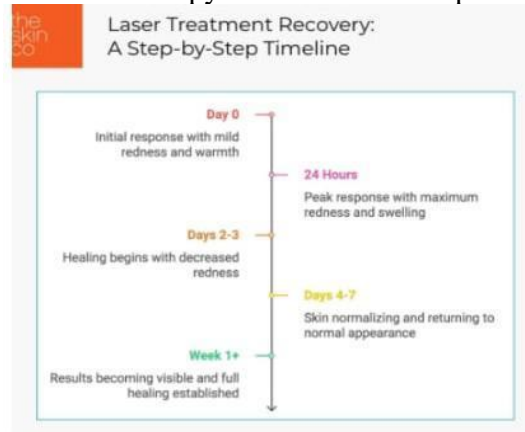
Figure 2. Skin Tissue Healing Process

to laser energy exposure. The laser works by stimulating biological processes in the tissue, such as increased collagen production, repair of the dermis structure, and accelerated cell regeneration (Khalid, 2016), thus requiring appropriate care support to optimize its healing process. Post-laser care, such as using moisturizers, sunscreen, and avoiding direct sun exposure, is very important to prevent irritation, hyperpigmentation, and other complications, while also helping to maintain the therapy results for more optimal and long-lasting effects.